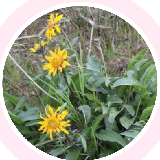
Diablo Sunflower ( Helianthella castanea ) California Rare Plant Rank 1B.2