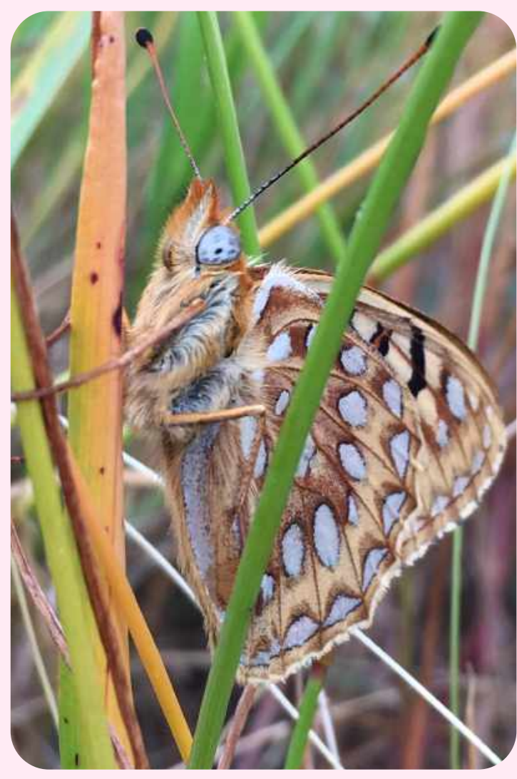
Callippe Silverspot Butterfly Federally Endangered