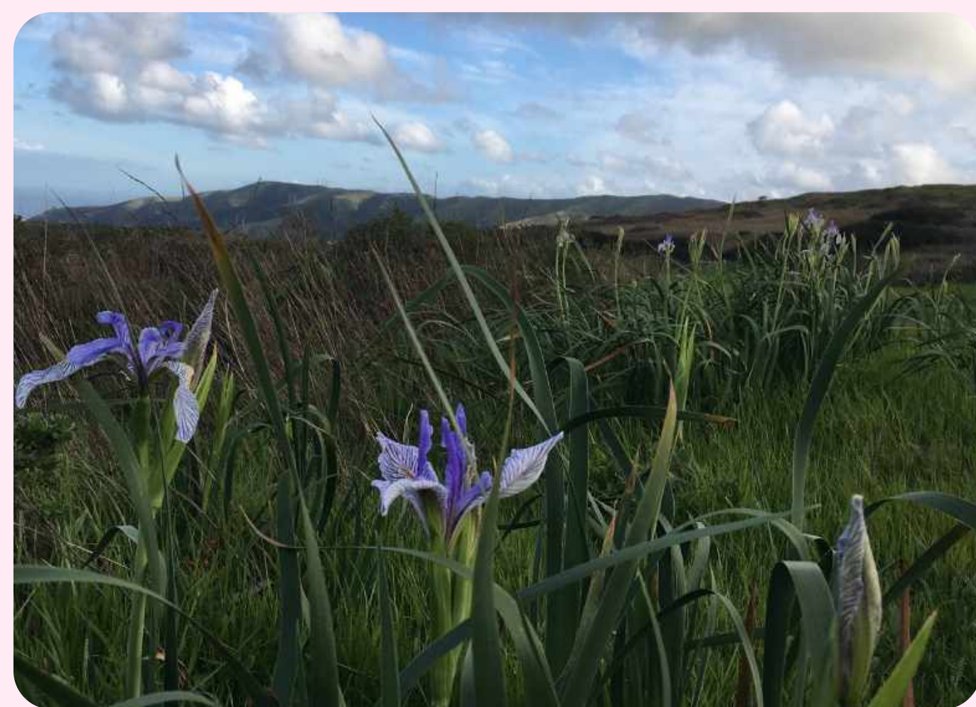
Coast Iris ( Iris longipetala ) California Rare Plant Rank 4.2 Limited Distribution