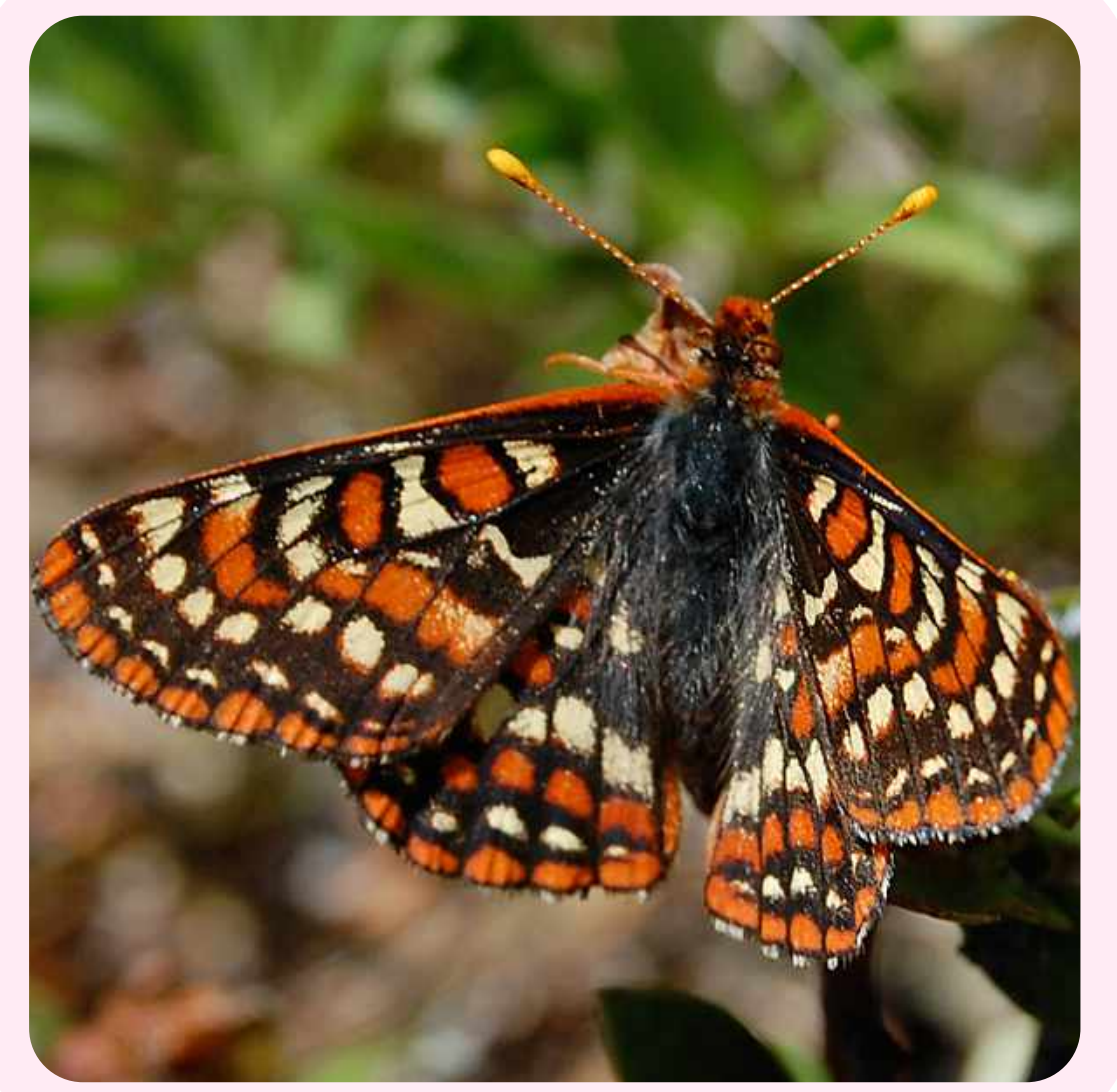
San Francisco Bay Checkerspot Butterfly Federally Threatened

Over 300 species of native plants grow on San Bruno Mountain. Many are rare and some are exclusively endemic to the mountain—they're found nowhere else on Earth.