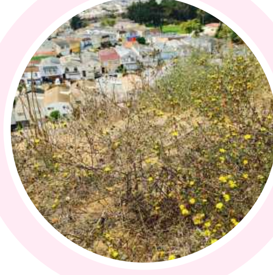
San Francisco Lessingia ( Lessingia germanorum ) California Rare Plant Rank 1B.1 Endangered Plant