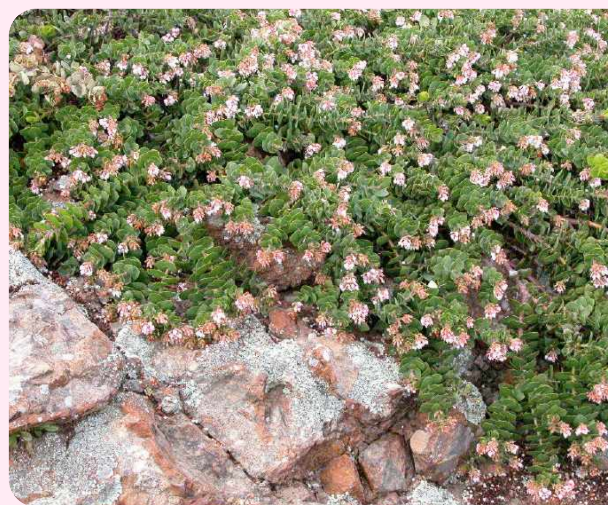
San Bruno Mountain Manzanita ( Arctostaphylos imbricata ) California Rare Plant Rank 1B.1 Endangered Plant