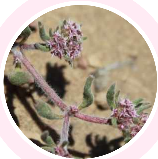
San Francisco Spineflower ( Chorizanthe cuspidata var. cuspidata ) California Rare Plant Rank 1B.2