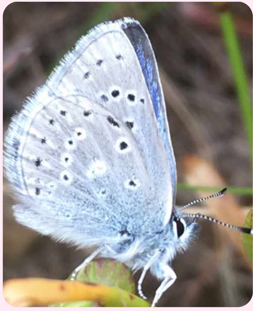
Mission Blue Butterfly Federally Endangered