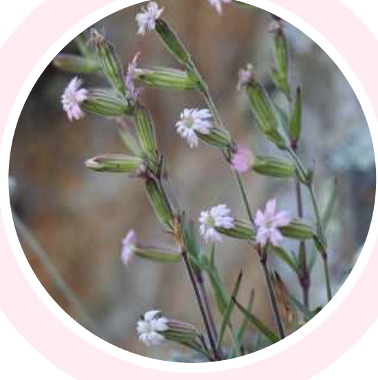
San Francisco Champion ( Silene verecunda ssp. verecunda ) California Rare Plant Rank 1B.2