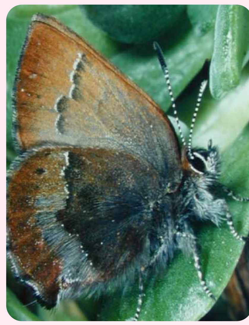
San Bruno Elfin Butterfly Federally Endangered