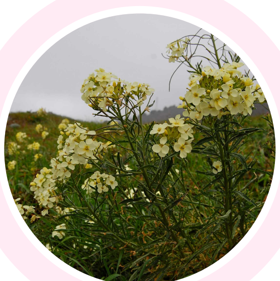
Franciscan Wallflower ( Erysimum franciscanum ) California Rare Plant Rank 4.2 Limited Distribution