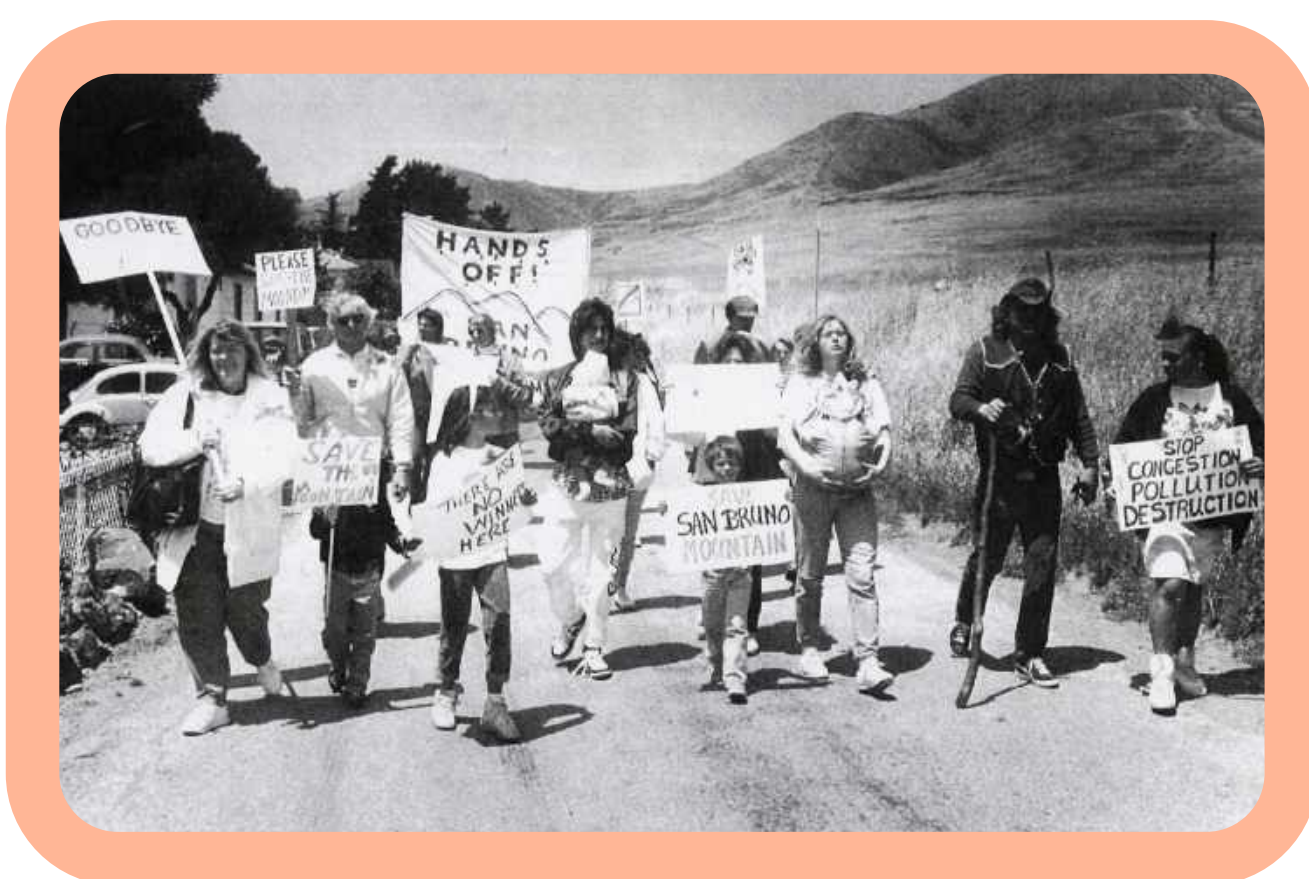
Opposition to the Terrabay project began in the 1980s, like the protest above in 1989.