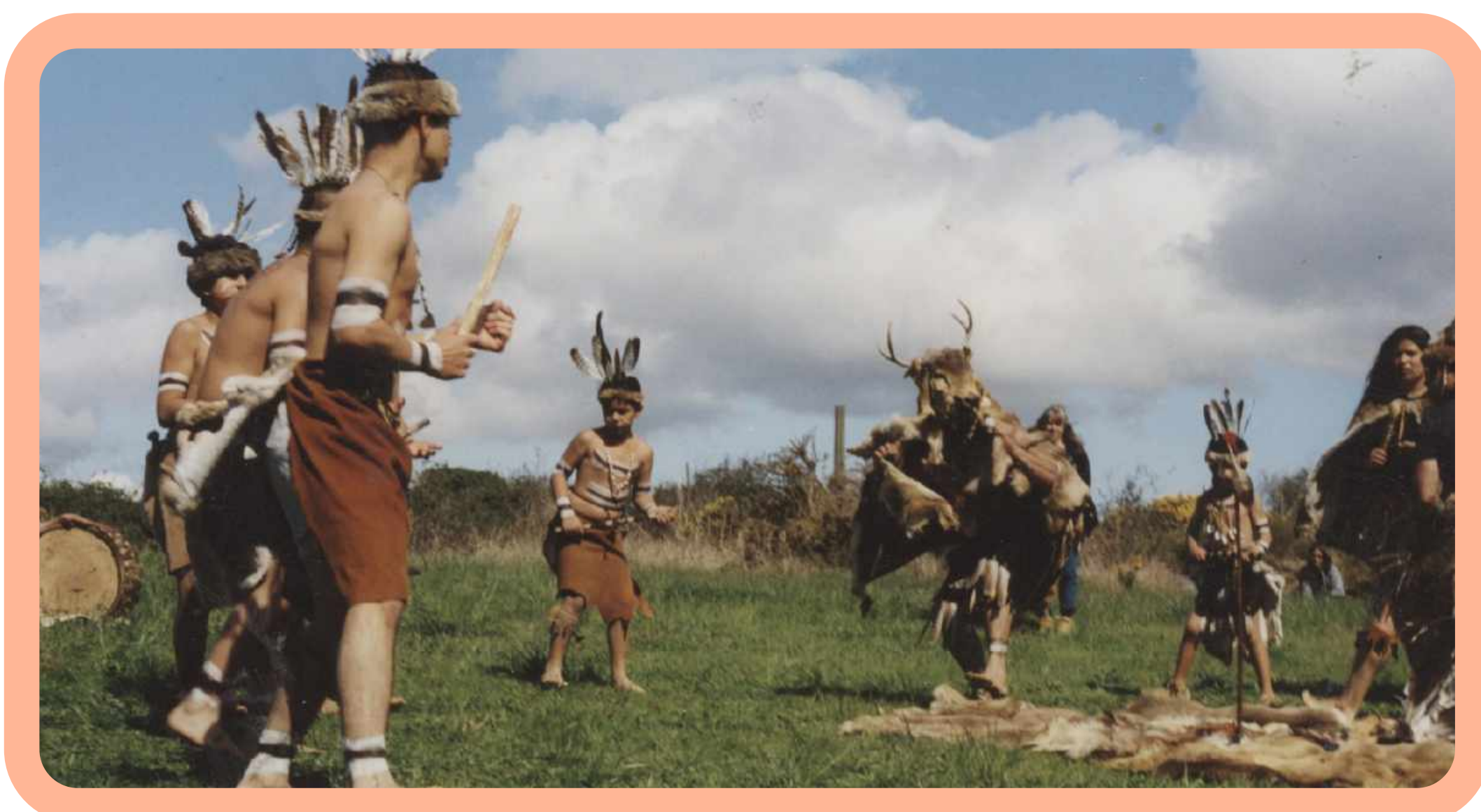
The protection of Ohlone heritage was honored with ceremony and dances on the mountain.